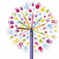
Children's Play, Learning and Development