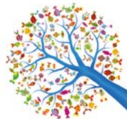
Countryside and Fish Management