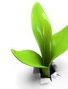
Enterprise and Entrepreneurship