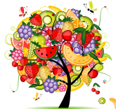
Health and Social Care