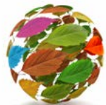
Forestry and Arboriculture