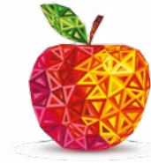
Art and Design